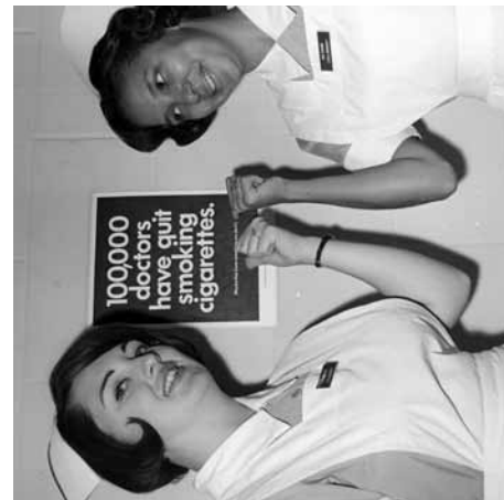
Nursing students in the 1960s highlight an anti-smoking campaign.