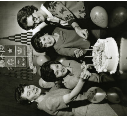
1967 birthday party

When you have questions about making a gift to Loyola’s Gannon Center, the Gift Planning team is ready to help. We welcome the opportunity to answer your questions. Please call or write us!